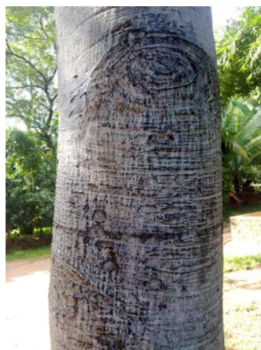
Maduca Tree - Bark after Printing - Cynometra cauliflora Tree