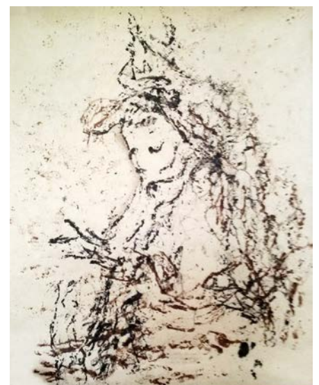
"Tree Spirit", bark print, 100x78 cm