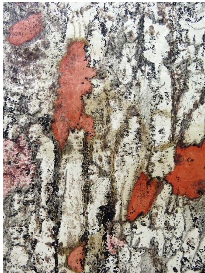
"Small Kingdom", 2014, details, bark print from a Maduca tree in Samriddhy, Auroville